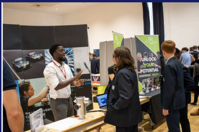
Students engaging with exhibitors.